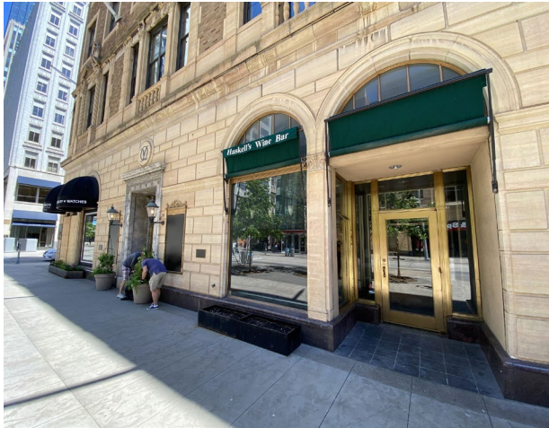
Outside entrance to space