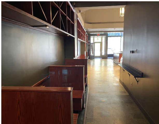
Close up of seating in back