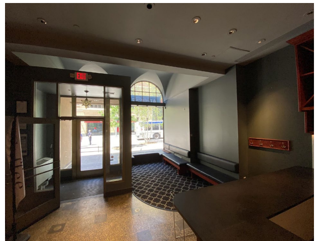
Front entrance with seating

Application form is available here: https://www.chameleonconsortium.com/application/