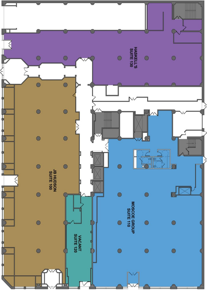
Vacant Suite 120