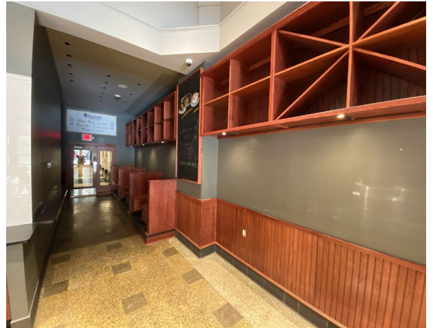
Back entrance to space with seating