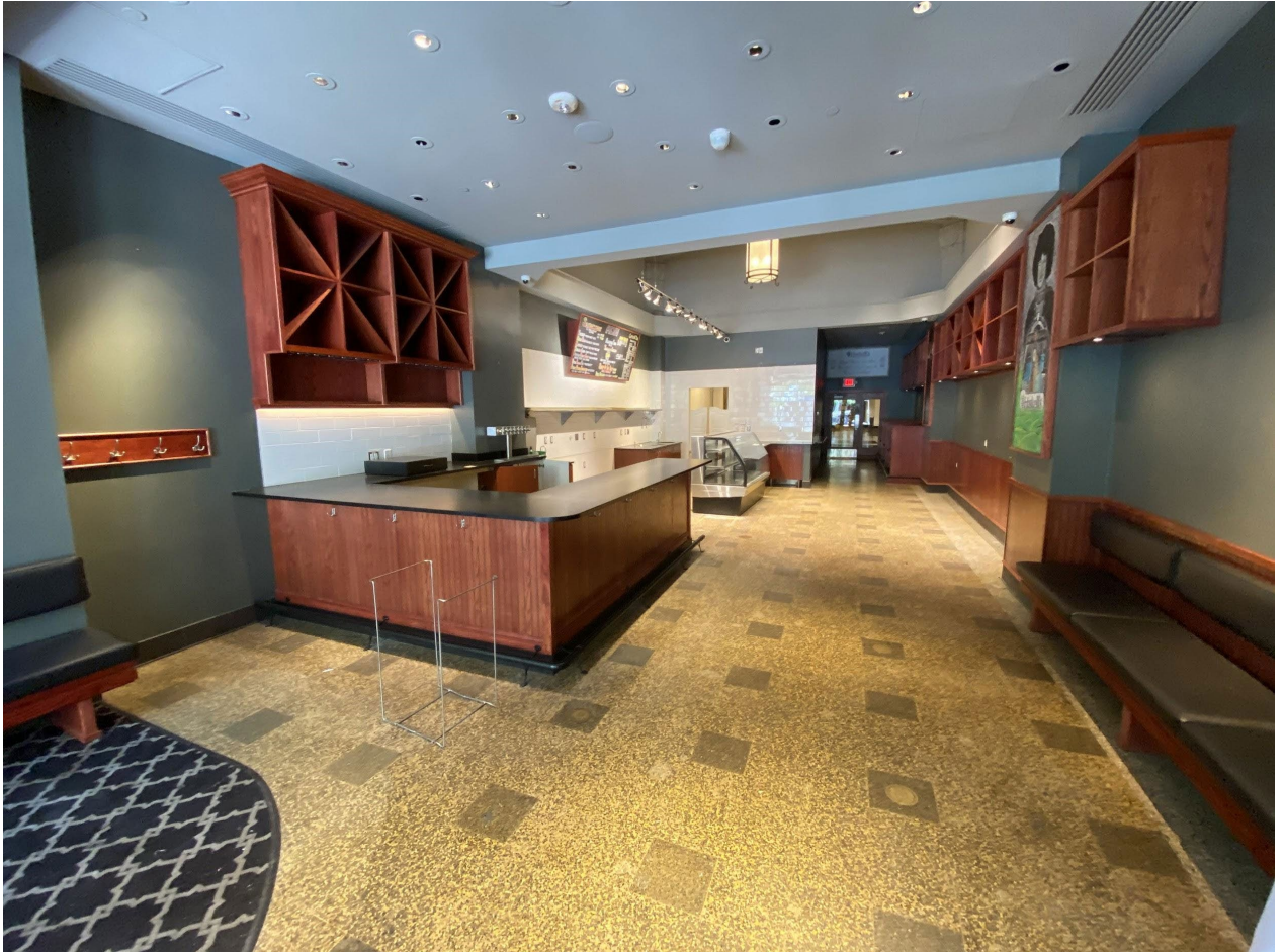
Selling counter and additional seating